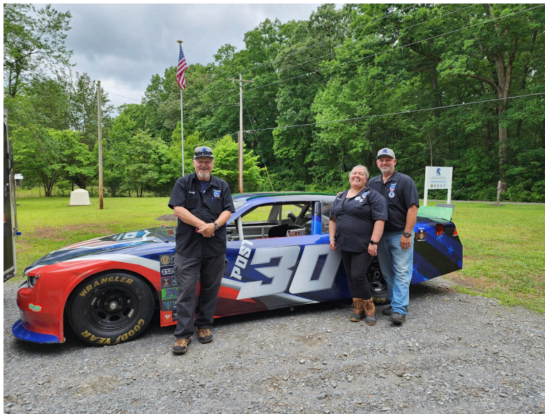
The Veterans Community Alliance Team.